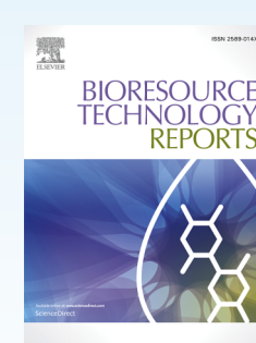
Bioresource Technology Reports (Elsevier) Cite Score : 6.3