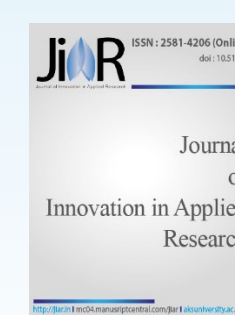
Journal of Innovation in Applied Research (AKS University)