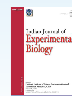
Indian Journal of Experimental Biology (NISCAIR)