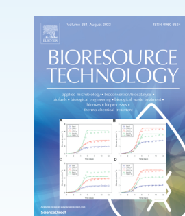
Bioresource Technology (Elsevier) IF : 11.88

Submissions for papers presented in AIBSBB-2023 will be open for all the journals listed below: